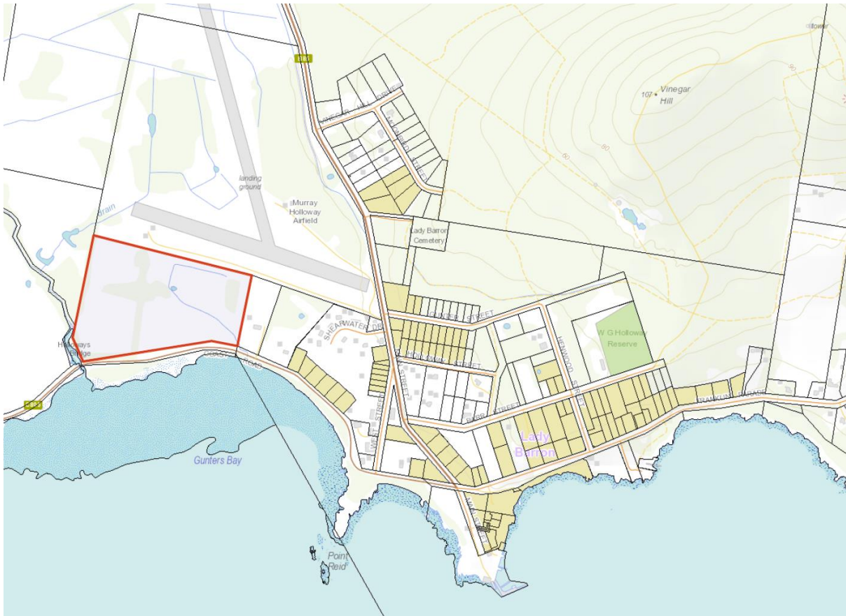
Map 1 – area affected by request